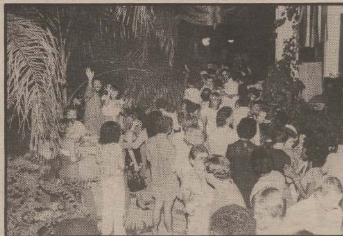
Alwun House gardens