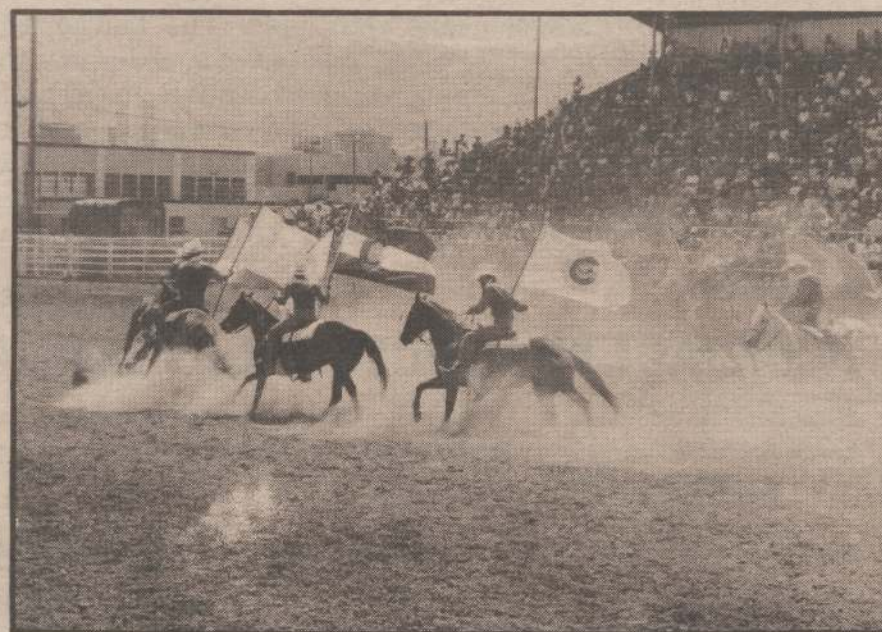
Denver Drill Team